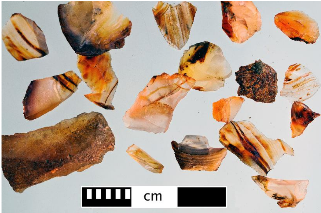
Fig. 3: Carnelian flakes from house 166

entrance to the house make an interpretation as stable for sheep or goats unlikely. Most probably the faeces were stored here to be used later as fuel. Apart from that a beehive shaped cellar was found (Ø478) in the house.