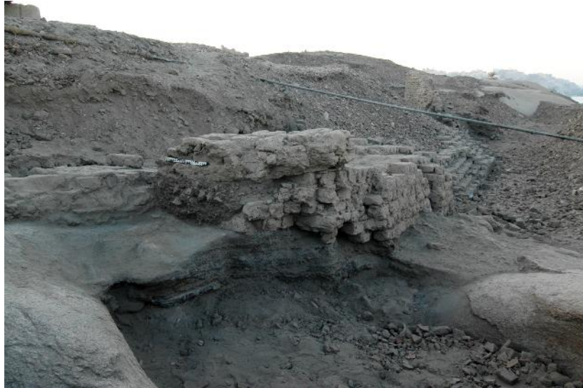
Fig. 5: Section through stratigraphy above the northern end of the town wall of the Middle Kingdom (Area XIX)

wall of the late 12 th dynasty studied in earlier seasons in areas XIV and XXXVI 11 . Only a tentative date, however, may be given at present for the short segment of a later town wall built on top of the earlier one since no layers connected to the wall are preserved. Pottery sherds collected from the mortar, however, point to a date not before the 25 th /26 th Dynasty.