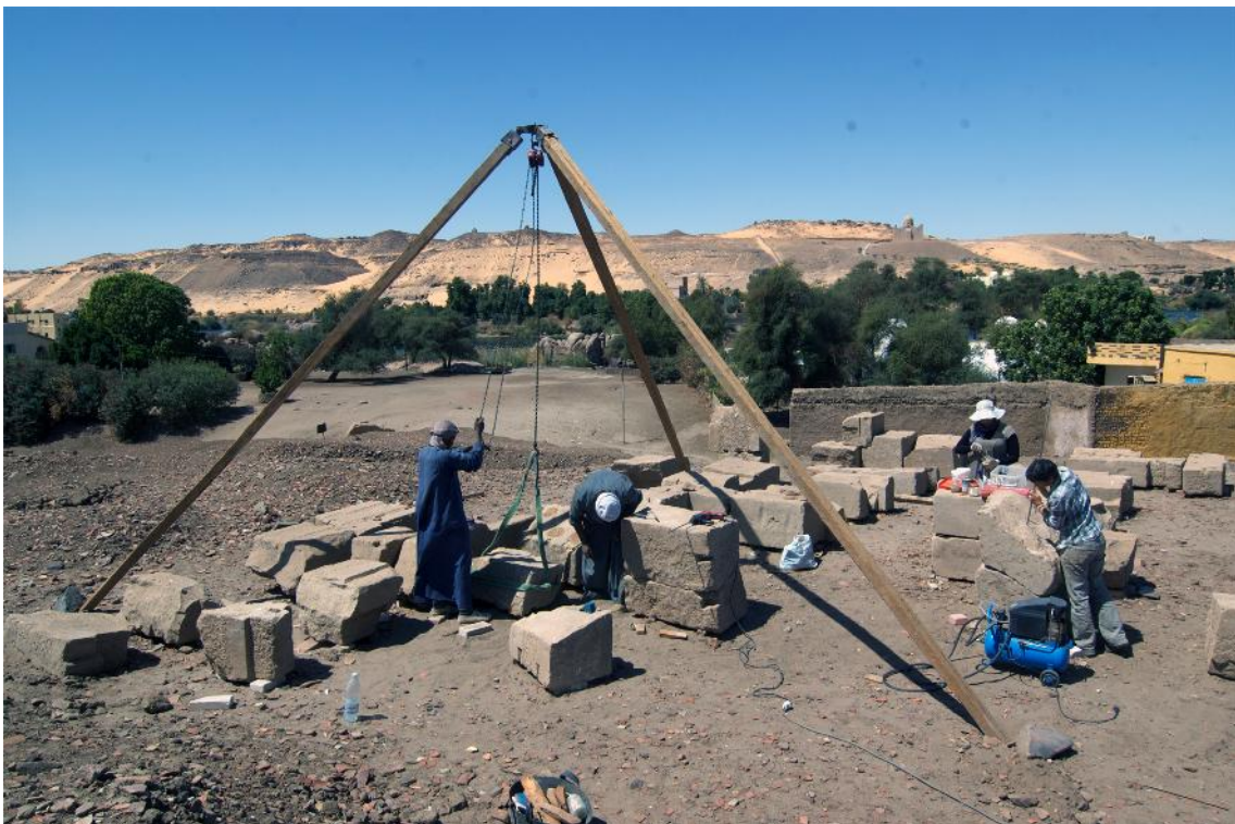
Fig. 14: Conservation works on site

were seriously damaged and showed several cracks and losses. Traces of earlier restoration work were removed in order to gain a homogeneous aspect of the surface. The surface was cleaned by applications of humid clay poultices to remove dirt, birds' excretions and salt concretions. In ancient breaks, the powdering of the sandstone's surface due to the cements was locally treated with an ethyl silicate (Syton® W30). Fragments bounding was made with dots of epoxy resin and the main fragments were doweled - given the relative thinness of the obelisks, doweling was made with fiberglass dowels to prevent thermal expansion of the metal in the stone causing cracks. The losses and missing parts were restituted with mortar made of lime and stone powder.