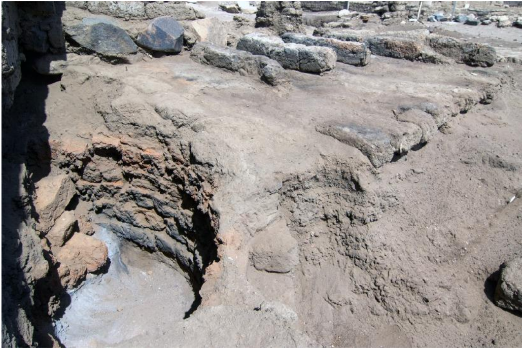
Fig. 10: Early Roman pottery kiln beneath furnace installation of a second phase of industrial activities in the temple precinct

The earliest house erected after the construction of the temple of the 30 th Dynasty is therefore house K29. The previously missing northern wall of the house was identified at the edge of the foundation trench of the temple's inner enclosure wall. Its way of construction points to the fact that it was build shortly after the construction of the enclosure wall was discontinued and was left uncompleted at the end of the reign of Nectanebo II. House K29, a tower house with a raised substructure build exceptionally in quarry stone masonry, subsequently guarded the access to the southern temple area and may have housed the temple administration.