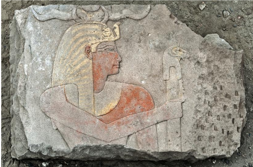
Fig. 7: A newly discovered relief showing the king holding the sacred staff of Khnum..

Pylon of Karnak. At Elephantine, two niches were arranged between the scenes, flanking the entrance gate. The decoration of the niches suggests that they were dedicated to the cult of the king and probably each housed a seated statue of Thutmose III facing the temple house.