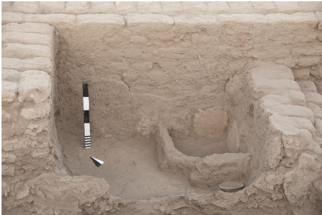
Fig. 2: Installation Ø468

(Ø468-Ø470, Fig 2) 5 , was found. Two further rooms (C and D) lay to the north and south of room B.