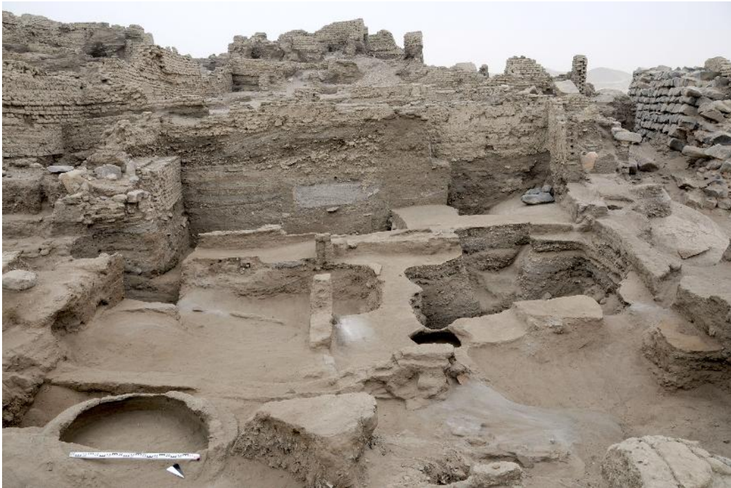
Fig. 4: Remains of house 168, to the right the pyramid

As a first step towards the aims of the project micromorphological samples have been taken from the eastern profile in the area of house 166 from and underneath the rectangular installations in room B. These samples were transported to the IFAO in Cairo in spring 2014 and are awaiting further processing and study.