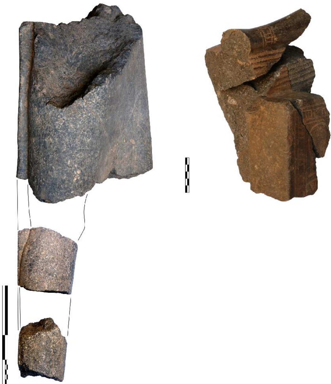
Fig. 12: Examples of reassembled fragments of statues

The assignment of fragments to sculptures has been verified and improved in several cases. Worth mentioning are four new joints. In order to verify whether the fragment K12516 of a backpillar (assigned to the enthroned statue of Psammetichus) fits to the head displayed in the Nubian Museum in Aswan (identified by S. Bickel as Psammetichus) 23 , a gypsum copy of the fracture has been taken. The same procedure has been chosen for the feet of an