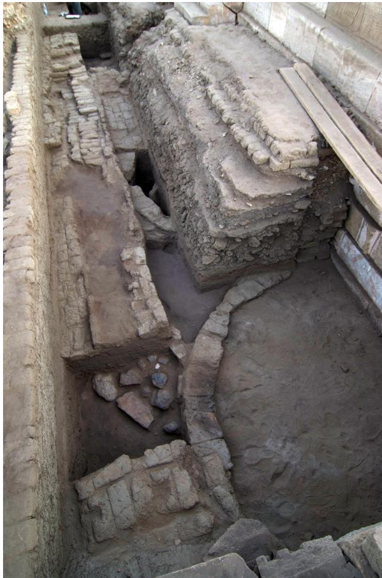
Fig. 9: New Kingdom granaries beneath a building of the 25 th Dynasty

During the spring season the investigation in the Khnum Temple precinct to the south of the temple of the 30 th Dynasty was resumed. A major aim of the work is a study of the function and spatial organisation of the district in immediate vicinity of the temple and its role as administrative and economic centre of the town.