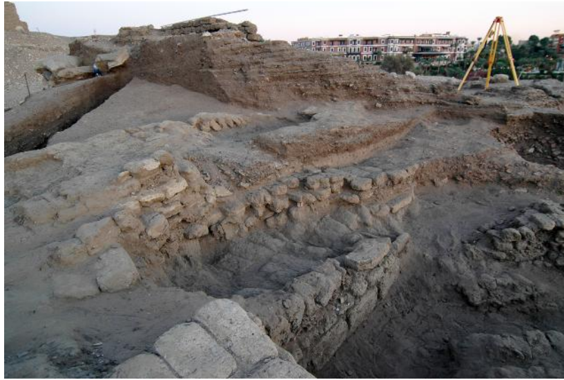
Fig. 6: Area XXXII. Layers of Dynasty 25 above remains of the town wall of Dynasty 20/21

A new fortification (well preserved further to the west) hence followed a different line in this sector. It is presumably to be identified as part of the fortification that was build during the Late Period immediately along the outside of the town wall of the 20th/21 st Dynasty.