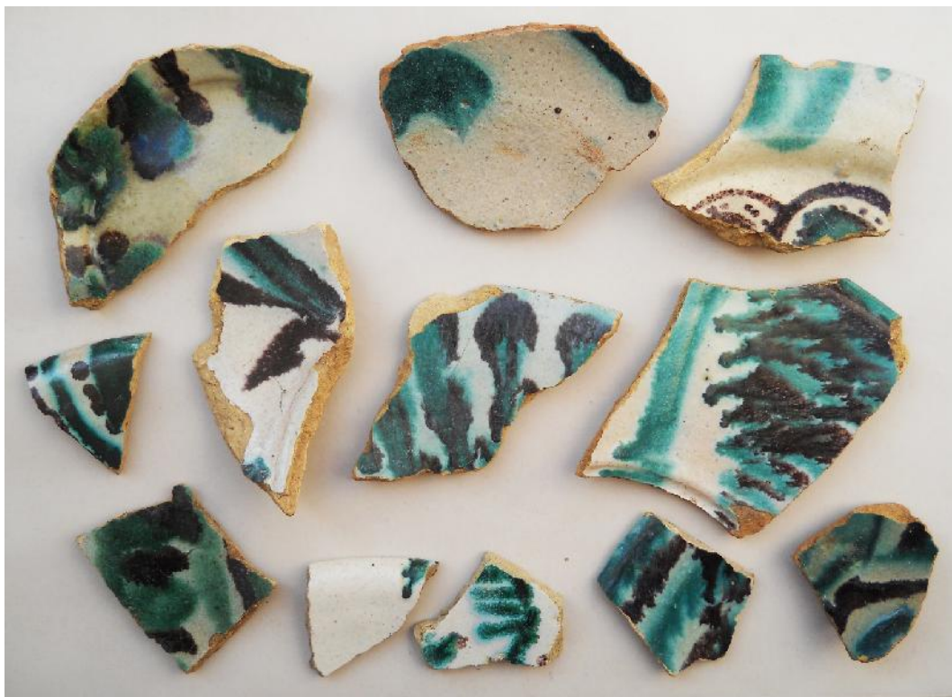
Fig. 13: Glazed pottery of the Islamic Period from Elephantine