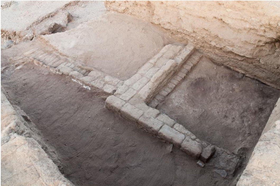
Fig. 11: Remains of a Ptolemaic-Roman building complex south of the Khnum temple

A short, slightly curved passage at the north-eastern corner of the court gave direct access to the side entrance of the temple of Khnum. The location of the building, the quality of its execution and the layer of animal dung strongly suggest that the building complex was used to house of the sacred ram of Khnum. So far only the burial ground of the animal had been known, on the opposite, northern side of the temple 22 . The chamber presumably served as the stable of the ram. Significantly, it lies exactly next to the three naoi housing images of the god within the temple house. The stable appears to have been built after the inner temple enclosure was finished by Ptolemy VI. It continued to be in use during Roman times, being refurbished several times. In the 5 th century A.D. the site was built over by a private house (K26).