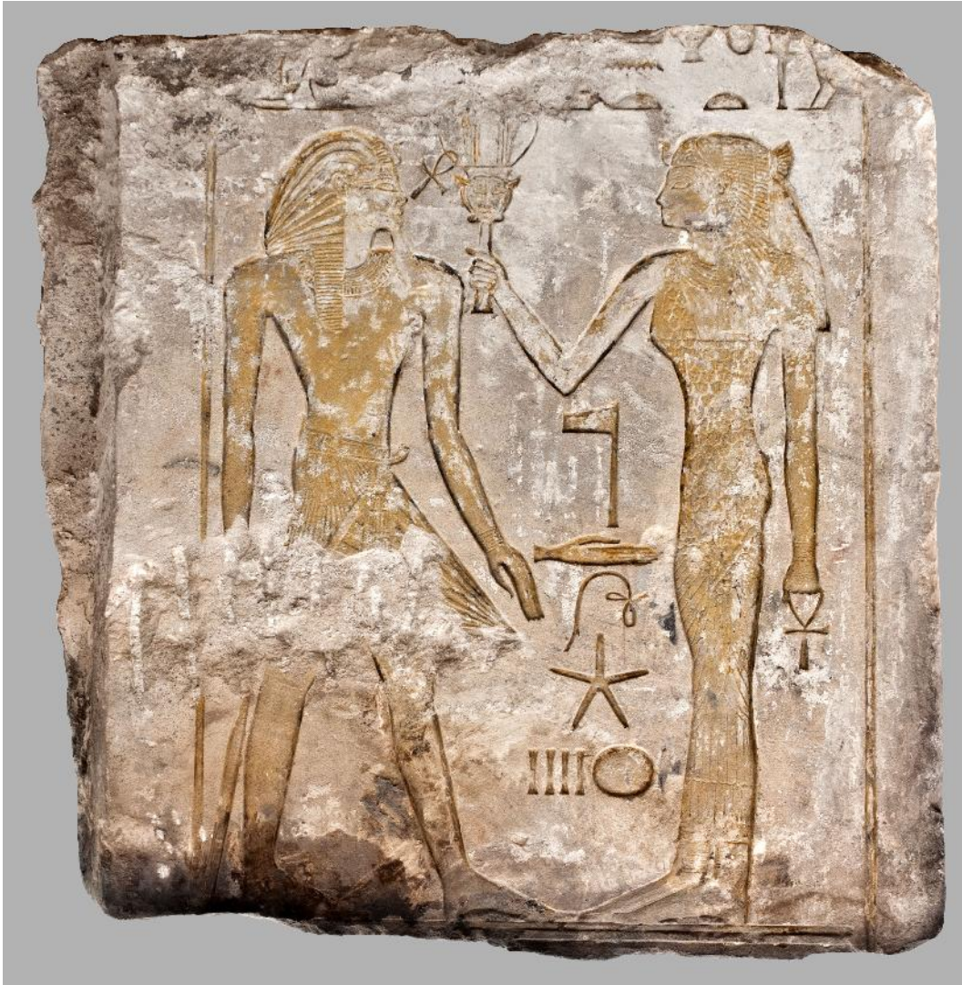
Fig. 8: Block from a gate showing Thutmose II adoring Anuket

the king being introduced into the temple by two goddesses, presumably Satet and Anuket. The gate may originally have served as the main entrance to the temple complex, only to be dismantled in the reign of Thutmose III to make way for the first pylon.